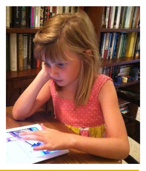
Onekama Consolidated Schools 3

Only a handful of schools in our area were honored. Benzie Central, Bear Lake, Mesick and Onekama were the only schools districts to receive such a designation. This demonstrates the wonderful combination of excellent students, quality staff, caring Board of Education, and supportive community we have here in Onekama.